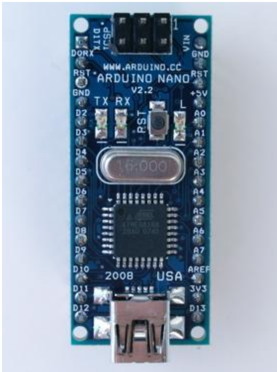
Arduino Nano Front