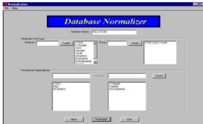
Fig. 1: Input relation example

Normalize Button: Used to perform normalization and generate the result of the normalization process.