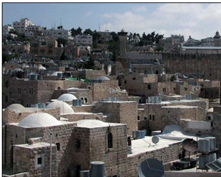
Figure 2: A view of the Old City from the east.