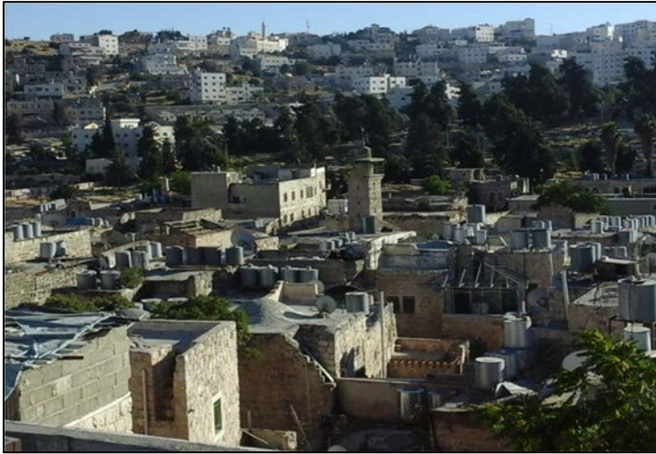
Figure 1: A view of the Old City from the west.