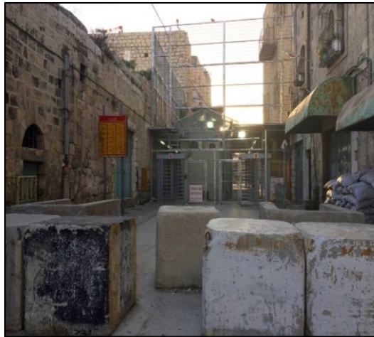
Figure 11: Shuhada'a street, North Ovest Old Town, checkpoint.

into two regions and the military rule of area H1, in addition to the topographical features of the Old City has made the people's daily life a struggle for survival. This coercive environment imposed by the Israeli policies is increasing the continuously forced displacement of Palestinians in the Old City; families have been forced to leave the area in the last few decades as a result of the perpetration of the crimes of colonization. In 2015, the Israeli army closed the Tel-Armeida neighborhood, declared it a closed military zone and imposed restrictions over the residents and their movement, which affected the houses and streets (Fig. 11 and Fig. 12). The closure of the front doors by the Israeli army forced the families to search for alternatives such as the use of backdoors or the roofs of neighboring buildings to enter and leave their homes or even turn windows overlooking streets into entrances, which made the lives of many original residents almost impossible [8].