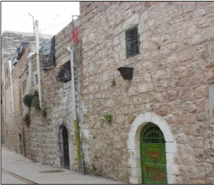
Figure 4: Houses of Bani Dar neighborhood.

3 THE COLONIES AND SETTLEMENT OUTPOSTS IN THE HEART OF THE CITY Settlement outposts are colonies created by the occupation of settlers of the homes and lands owned by the Palestinians and are usually situated nearby existing settlements as a strategy to expand these settlements (Fig. 5). The Old City is subjected to constant violations by extremist Jewish settlers alongside the occupation forces since the 70s of the passing century, which has led to the creation of six colonies in the Old City. These colonies are the Settlement of Beit Hadassah (Al Dabouya) (Fig. 6), which is a building in the heart of the city that used to be a school in the era of Jordanian rule. The Settlement of Avraham Avinu, a large residential building located near the old vegetable market in the center of the city (Fig. 7). The Settlement of Osama Ibn Munqez, which transferred to Beit Romano School by Israeli settlers. The Settlement of Tel Armida, which looks like a fortress surrounded by iron gates and watchtowers, this area is believed to be the site on which Hebron was built. The Settlement Commercial Center beside the Ibrahimi Mosque (Gautic). Beit Al-Rajabi settlement, in 2014, an official colony was established in the house of Al-Ragabi family, which Israel recognized and supported [5].