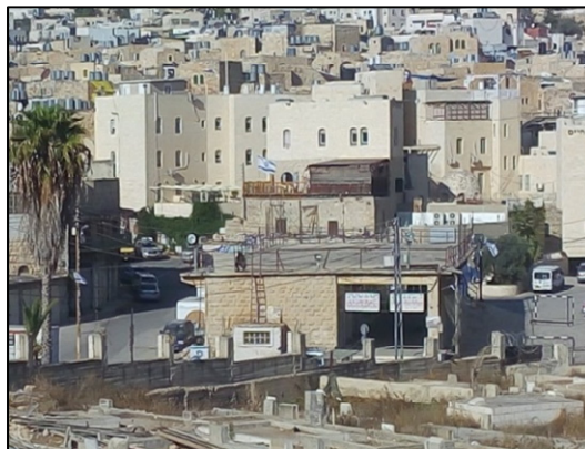
Figure 7: The Avraham Avinu settlement.