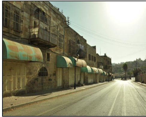
Figure 8: Closed shops in Shuhada'a street.

The establishment of settlements in the Old city has deprived the Palestinians from their right of residence, and the efforts of the Israeli occupation forces to limit the Palestinian presence in the city takes various forms, such as the confiscation of residential property and restrictions on access to certain places. The army identified a range of land in the center of the city where the movement of Palestinian vehicles and pedestrians is prevented, in addition to the many examples of methods of abuse, physical violence, shooting, robberies, denial of family reunification and the presence of Israeli soldiers at every corner to protect the settlers and harass the Arab population. These policies affect mostly the Palestinians living in Tel Armida neighborhood and al Shuhada'a Street. In addition to the Israeli unjust action against the citizens of the city, where the occupation completely closed the archway of Khuzq Al-Far gate With a metal door, which made it a dam blocking the flow of rainwater through this archway to its natural course through the Hebron Valley. As a result, the winter rainfall in the Old City increased to about 150 cm, which led to the leakage of water into shops and low-lying houses, causing numerous collapses, environmental pollution, and saturating the foundations of buildings with mineral salts and contaminants [6].