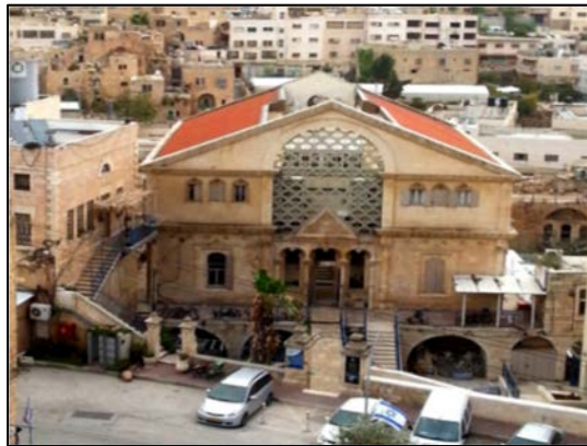
Figure 6: Al Dabouya settlement.