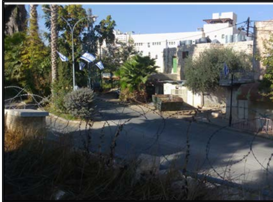
Figure 5: The Israeli closed.