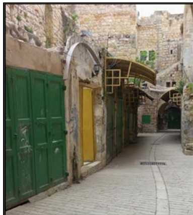
Figure 3: Roads and closed shops in the Old City.

The Old City today is home to a population of 6500 people, its area by 2015 was 1 km 2 and has become characterized today by closed commercial stores and homes, empty streets, and the continuous and non-ending presence of the occupation's army and settlers. In addition, due to its political and religious importance, it has become a target of the colonial movement, as such within the 80s of the passing century, many illegal colonies were built inside the town, this was followed by many restrictions on the movement and entry of the Palestinians, and closing of roads, passageways, and streets. Aside from violation of basic human rights due to these policies, it is clear that it conflicts with the design of the Old City, and these restrictions imposed and violations by the colonial army stand in the way of fulfilling basic living needs and restrict freedom of movement. In addition, the colonies have been formed with complete disregard of heritage values, urban environment, and natural landscape, which has led to the corruption of heritage property and spaces and imposed restrictions on urban planning [4].