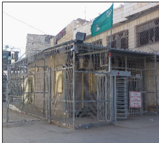
Figure 12: Al Shuhada'a street, South Old Town, checkpoint.