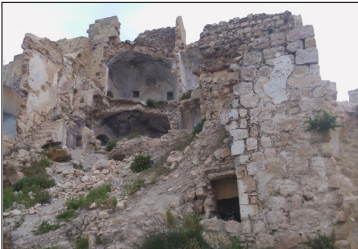
Figure 10: The destroyed in Old Town after the division of the city.

In addition, issuing military orders to open new settlement roads, such as the order that opened a settlement road linking the settlement located in Tel Armida to the middle of Al-Shuhada'a street, and the military order, which destroyed the historic buildings in the Old City of Hebron to create a settlement road linking the settlement of Kiryat Arba to the Ibrahim mosque (Fig.10) [7].